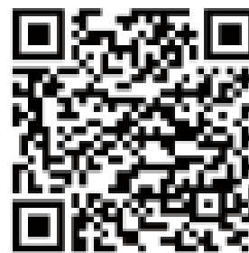
Android Pro App