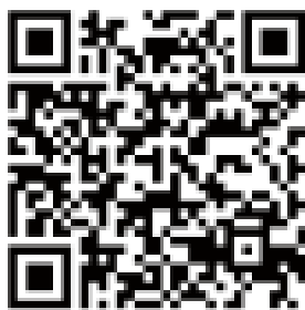
iOS Pro App